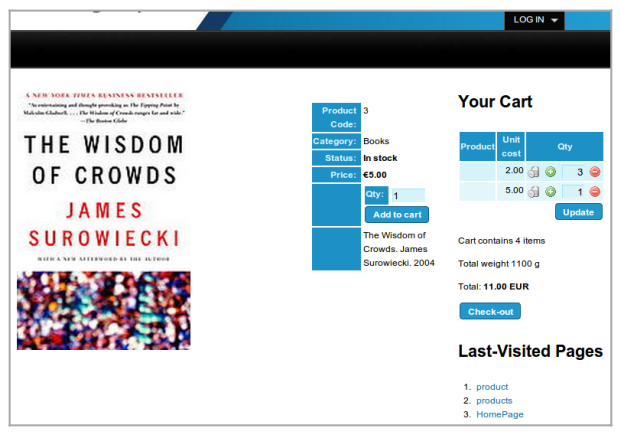
Click to expand