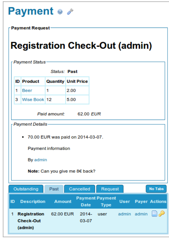
Click to expand